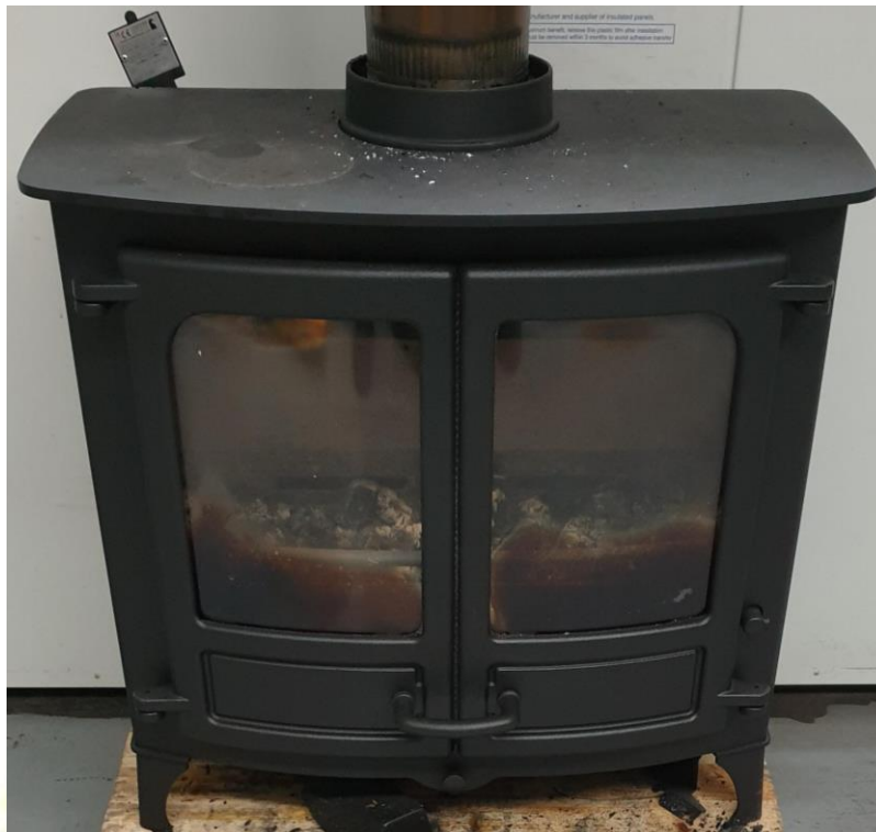
Figure 1: Appliance during testing.