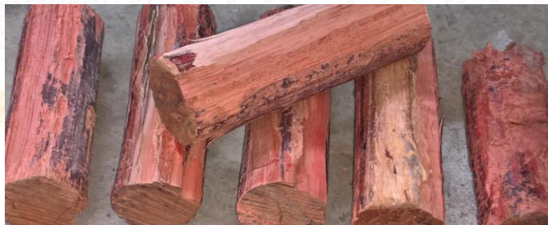
Figure 2: Test fuel load.