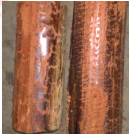
Figure 2: Test fuel load.