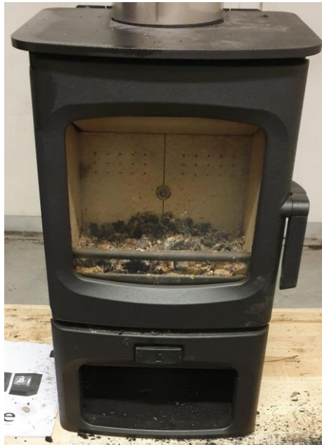
Figure 1: Appliance during testing.