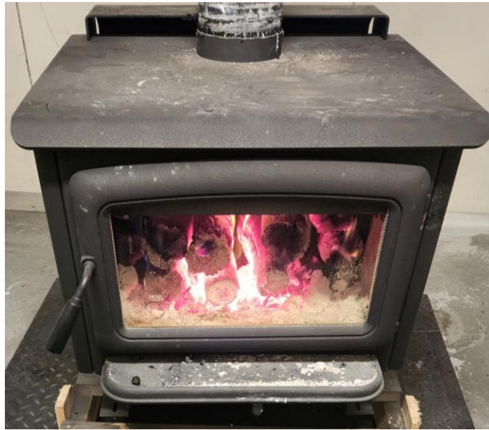
Figure 1: Appliance during testing.