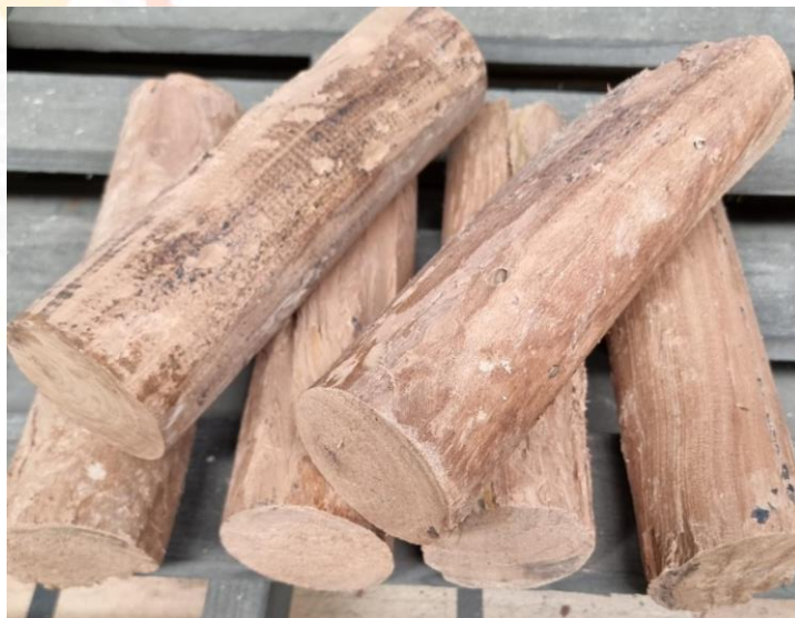
Figure 2: Test fuel load.