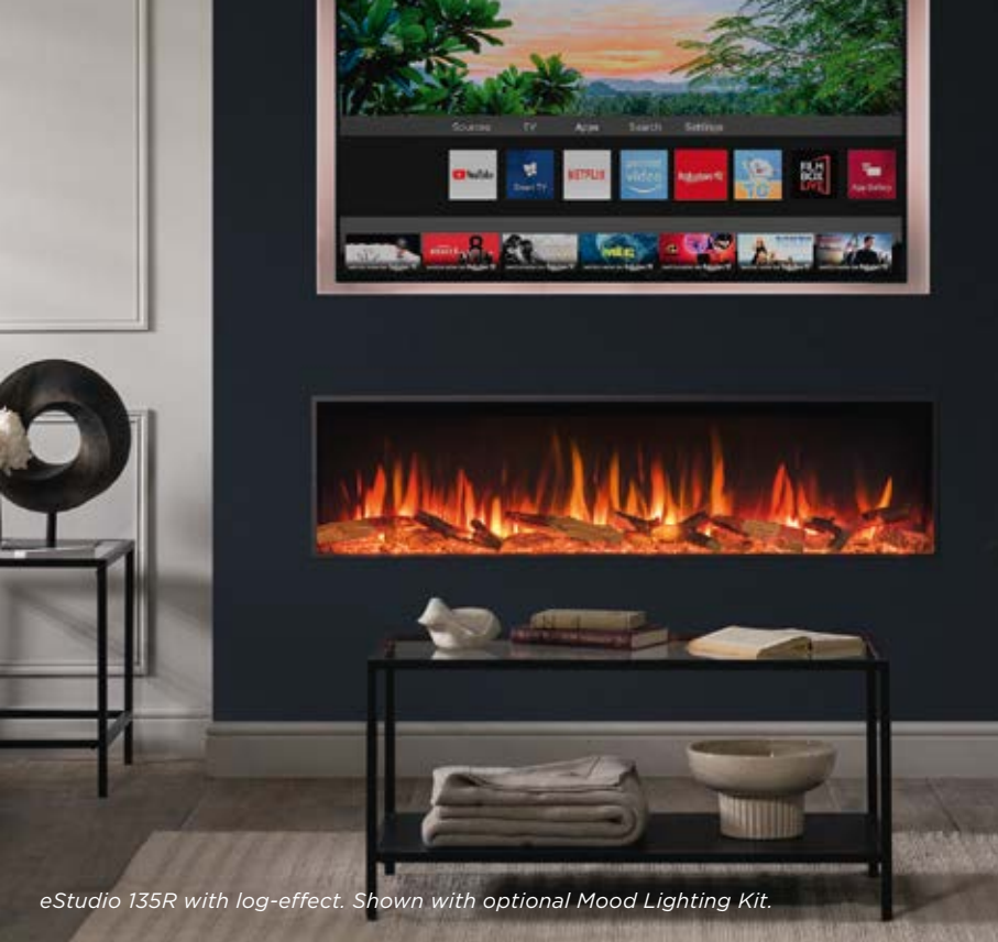
eStudio 135R with log-effect. Shown with optional Mood Lighting Kit.