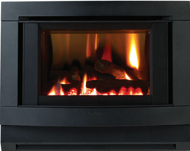
Cannon Cremorne Inbuilt Power Flue